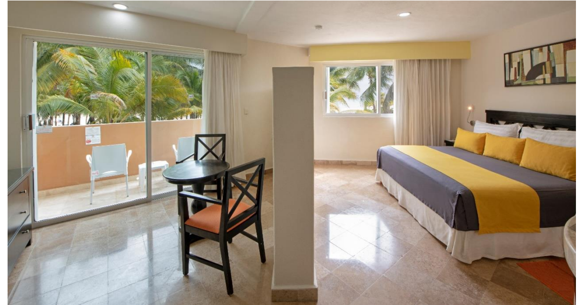
Superior Ocean Front - Honeymooners