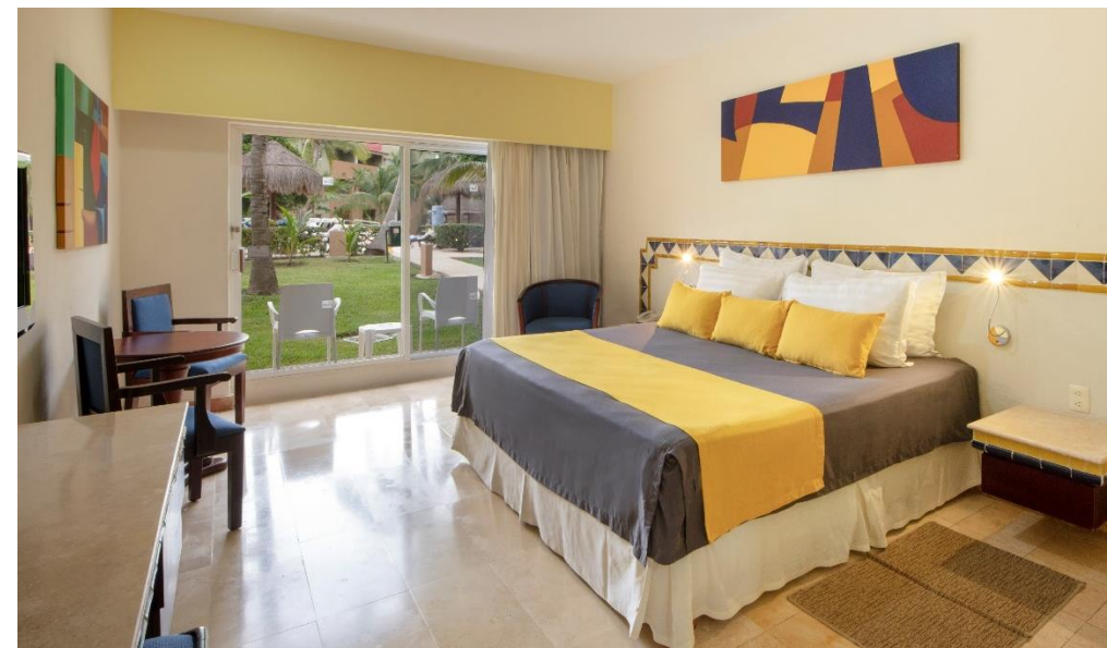
Superior Garden View