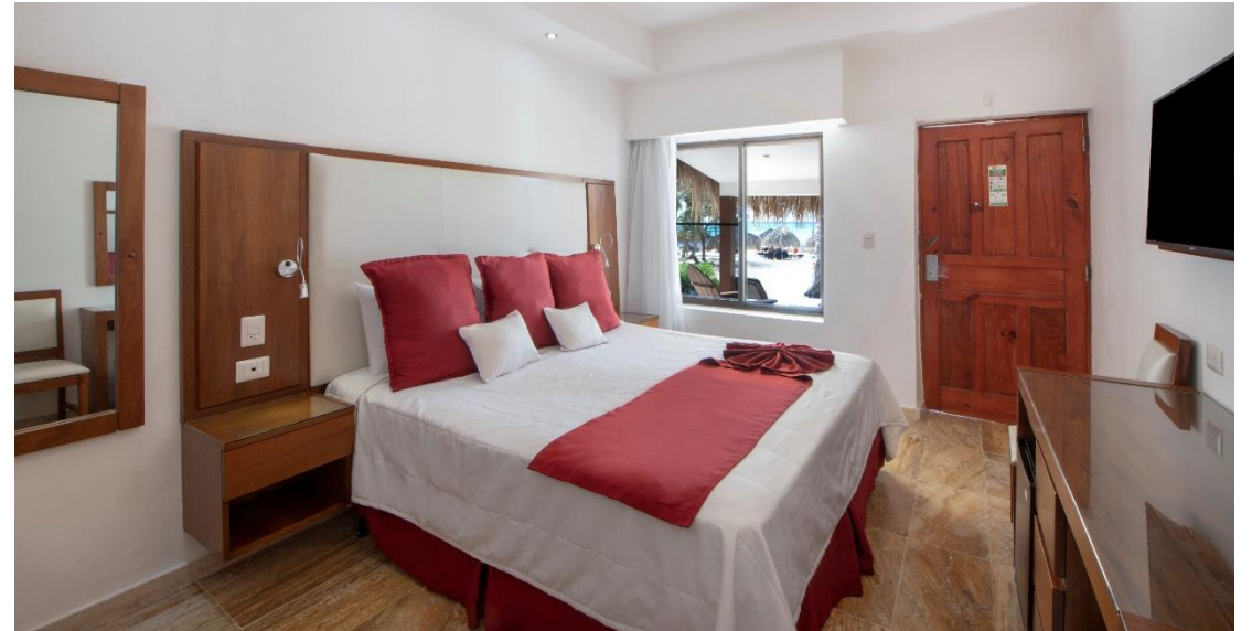
Bungalows Ocean Front