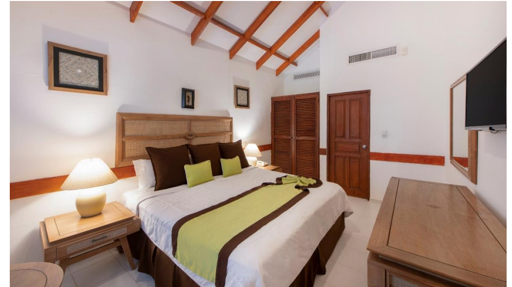
Bungalows Garden View