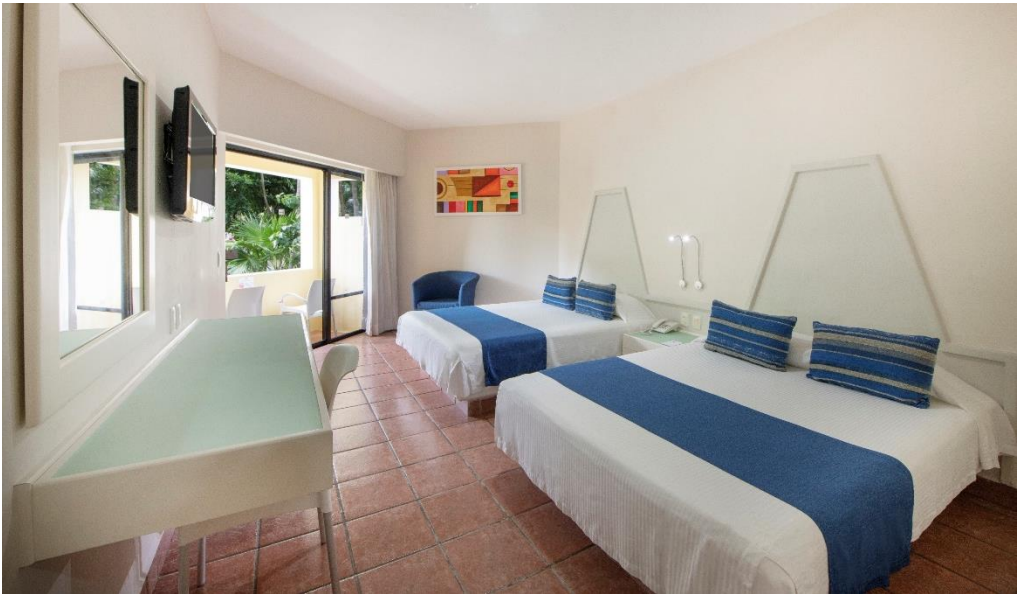
Superior Garden View