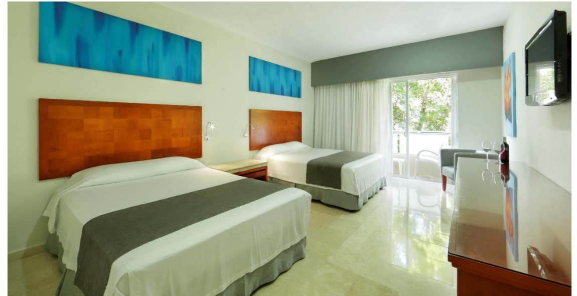
Deluxe Garden View