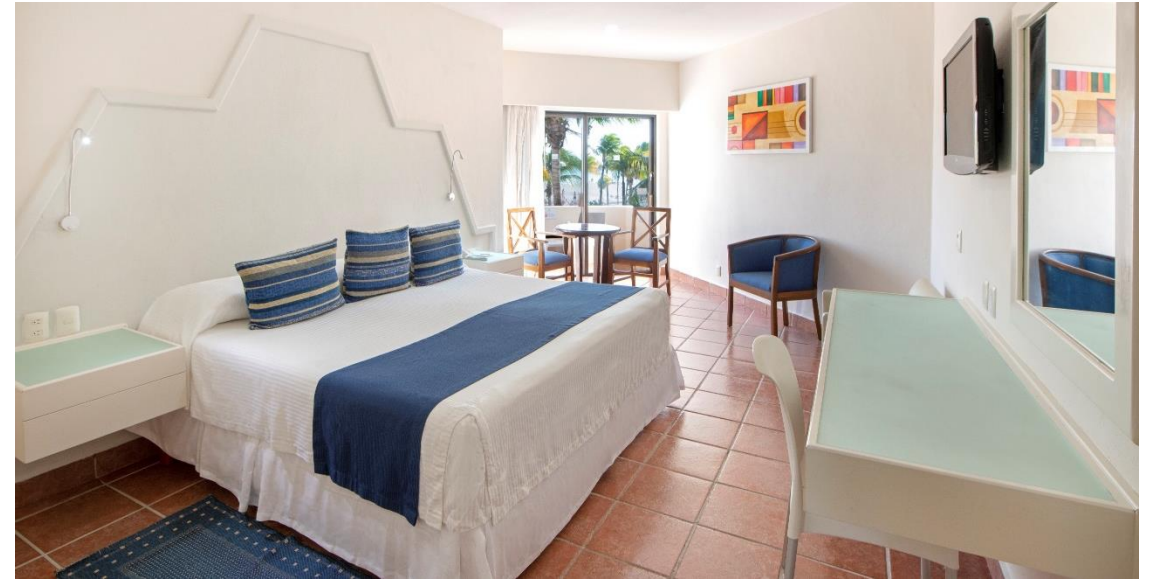
Superior Ocean View