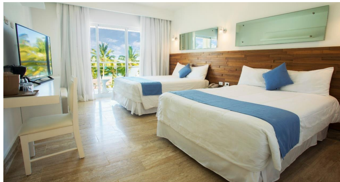
Superior Ocean View