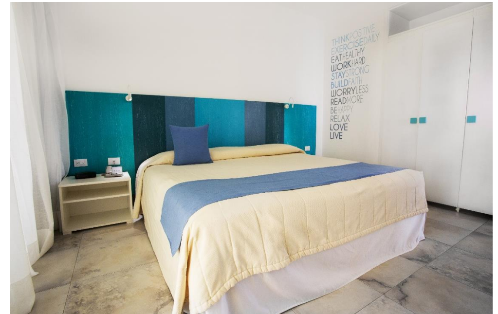
Superior Garden View